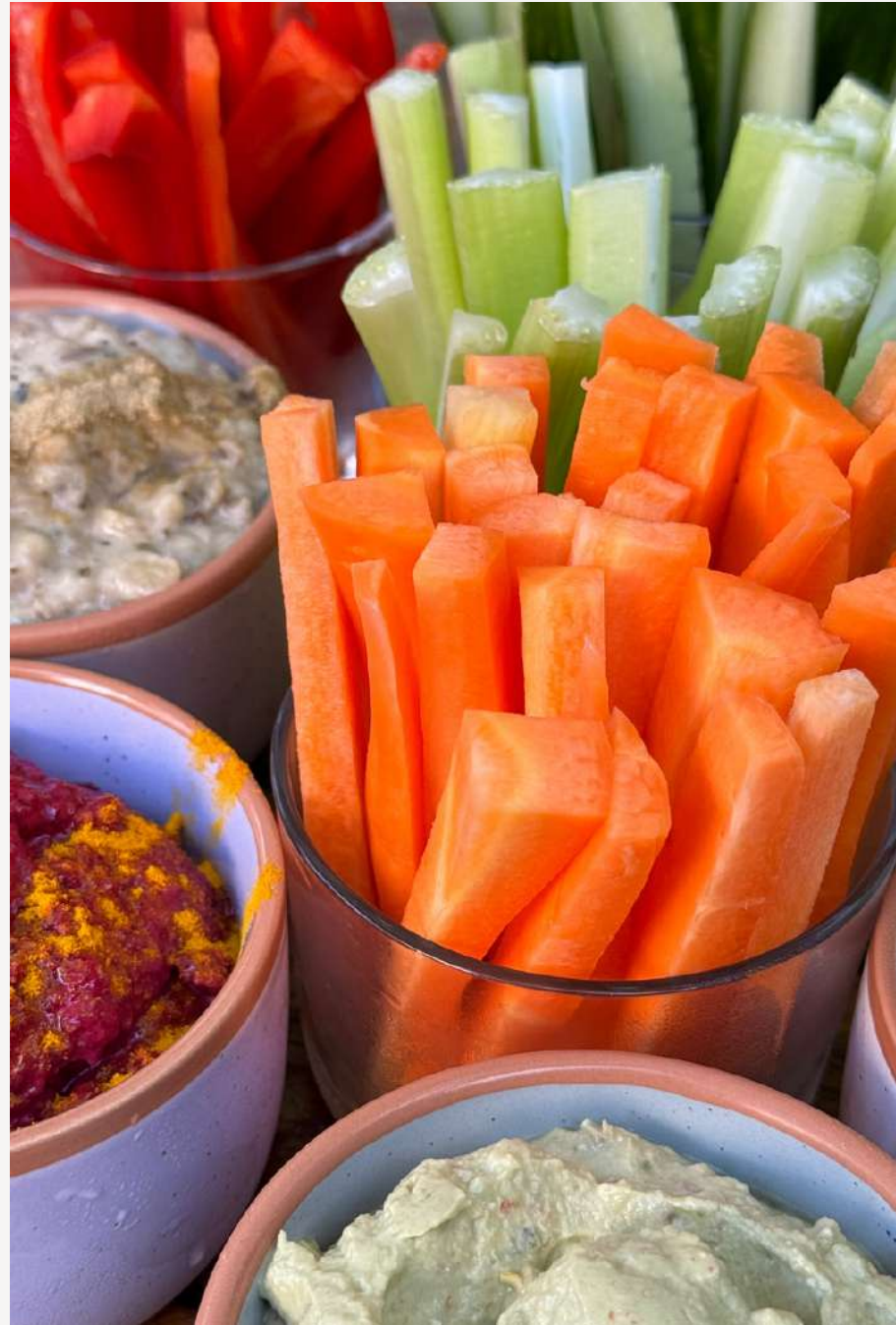
VEGETARIAN PLATTER $70 Fresh and marinated vegetables, selection of dips DFA, vgA