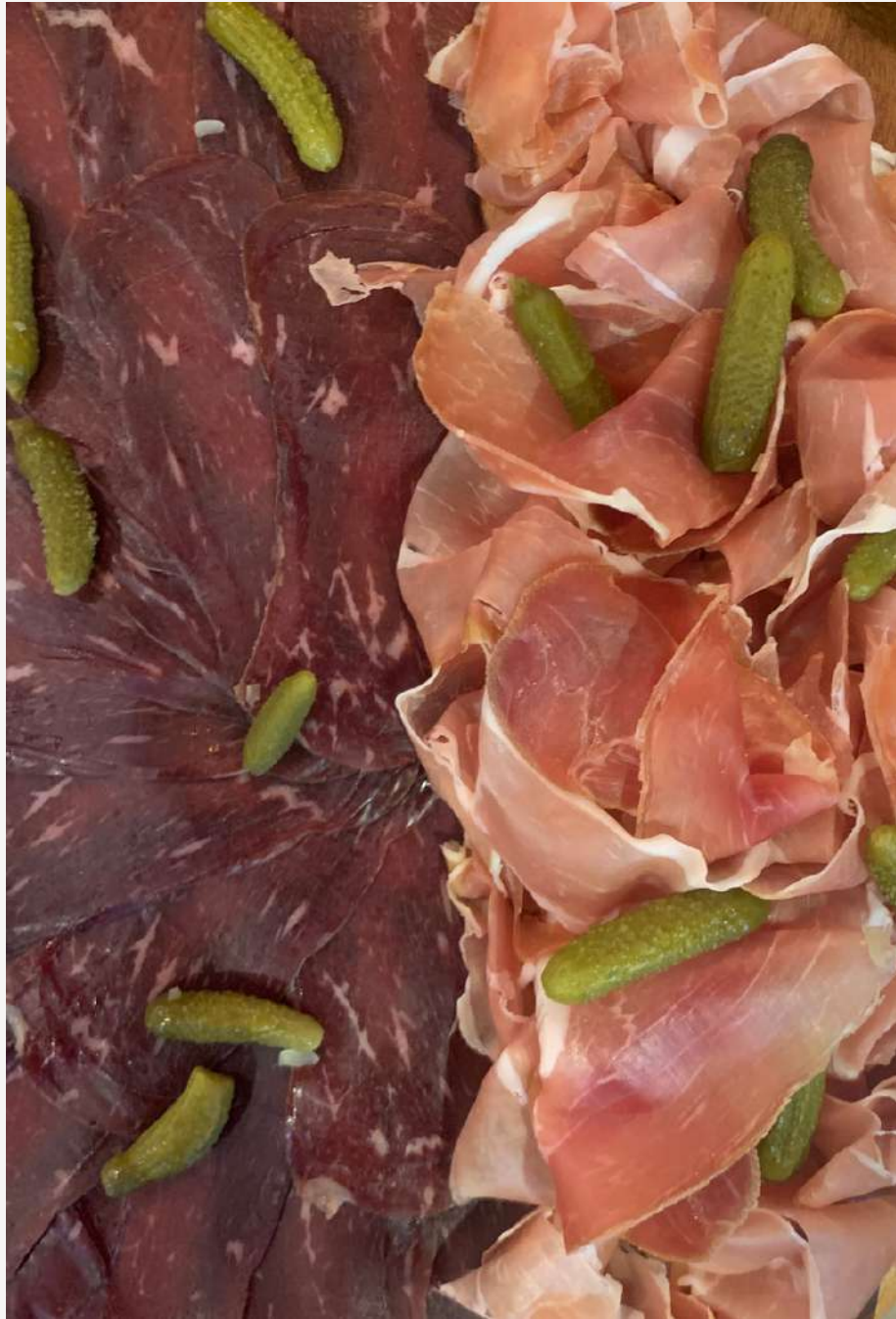
CHARCUTERIE PLATTER $100 Selection of local and imported cured meats, cornichons and local artisan charred sourdough DF, GFA

Platters serve 8 to 15 guests as a light snack. Add Gluten Free bread and crackers $5