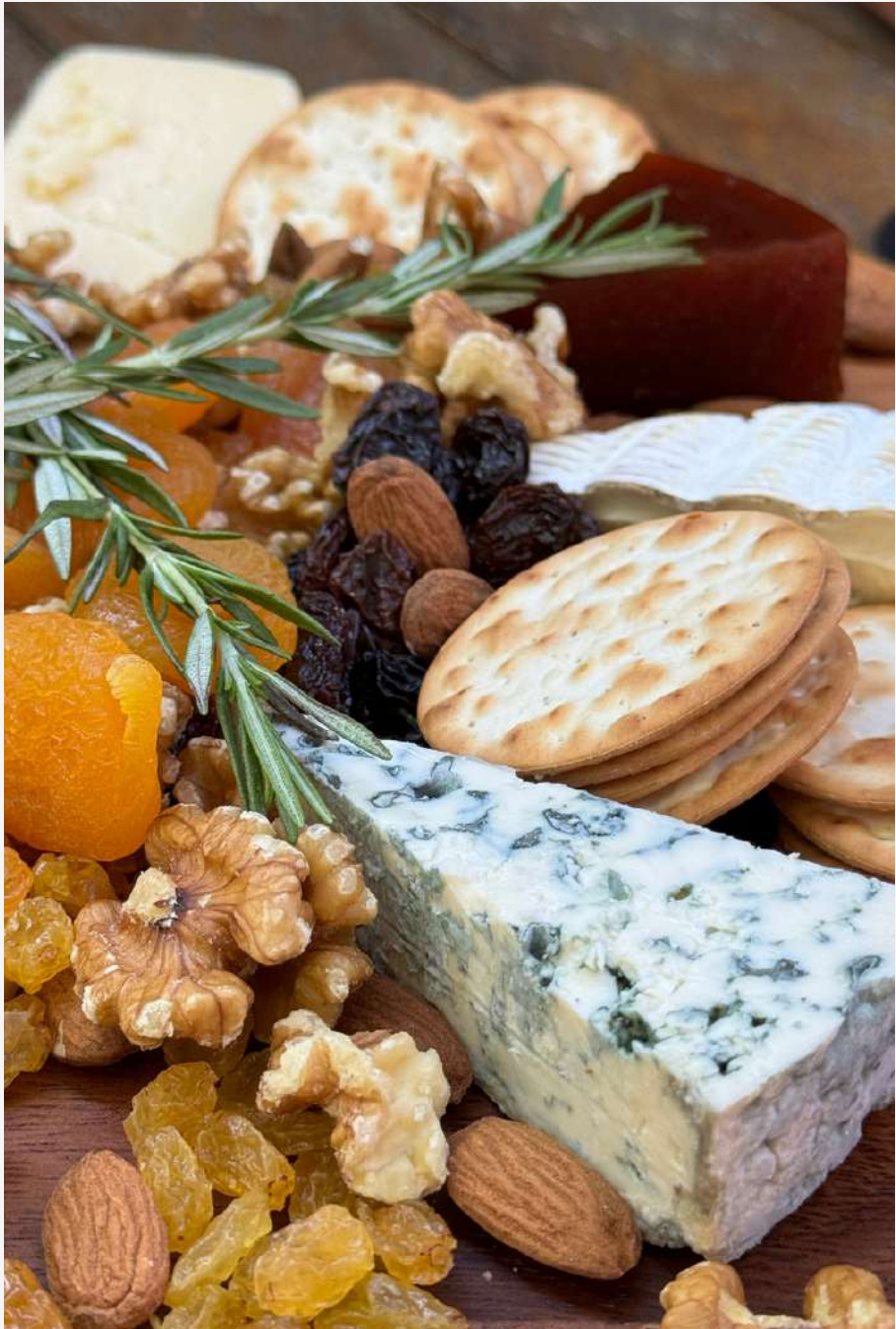
CHEESE PLATTER $90 Selection of local and imported cheeses, dried and candied fruits, crackers, GFA